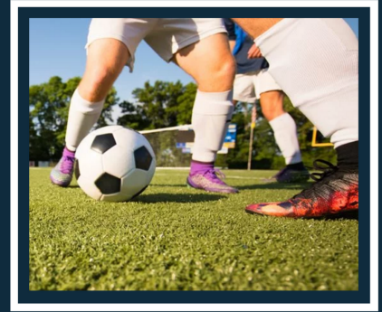
Green Space Turf Field

Help Complete the Project and Add Your Name in a Donation