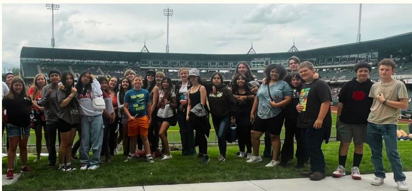
Great field trip to Utah for the the Bee's Game and the Mall.